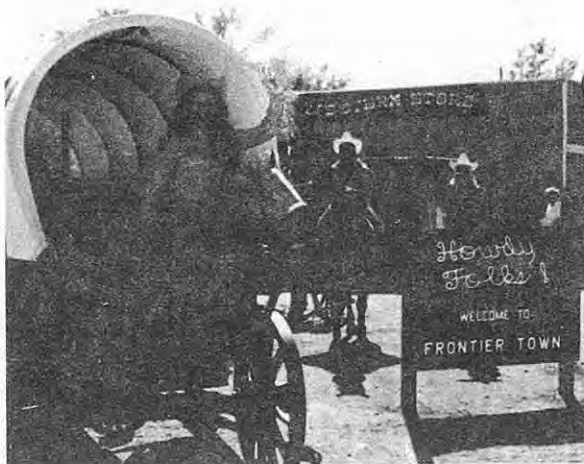
▲ Howdy Podner!