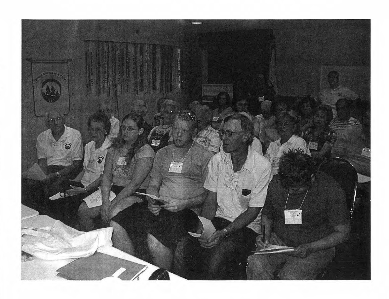
At the Annual Business Meeting, Hutchinson, KS