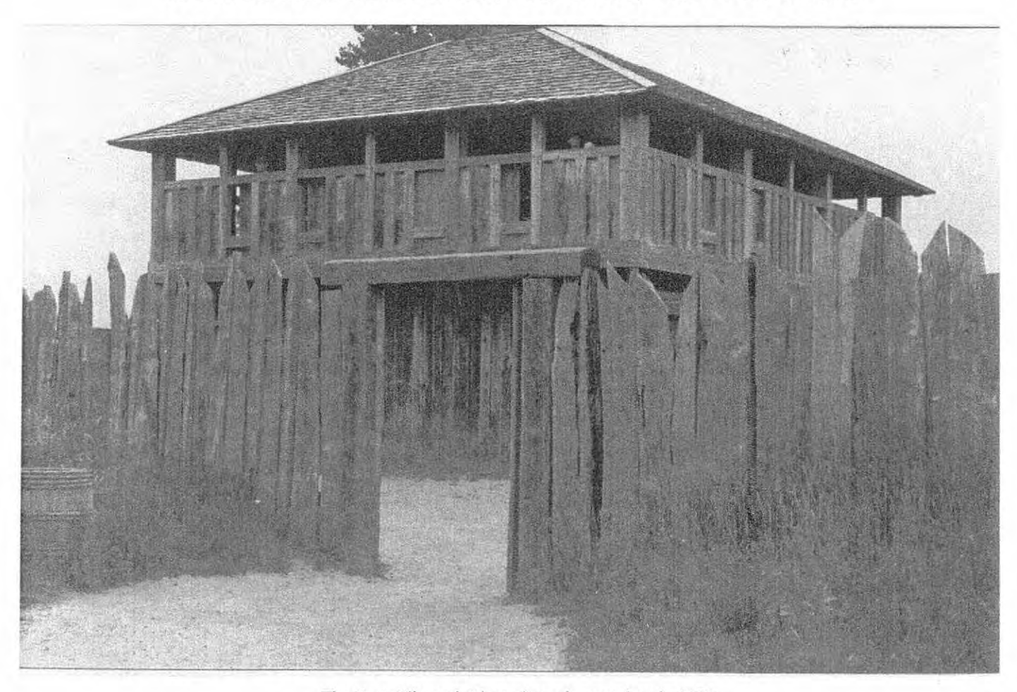
The Fort, Plimouth Plantation, picture taken in 1996