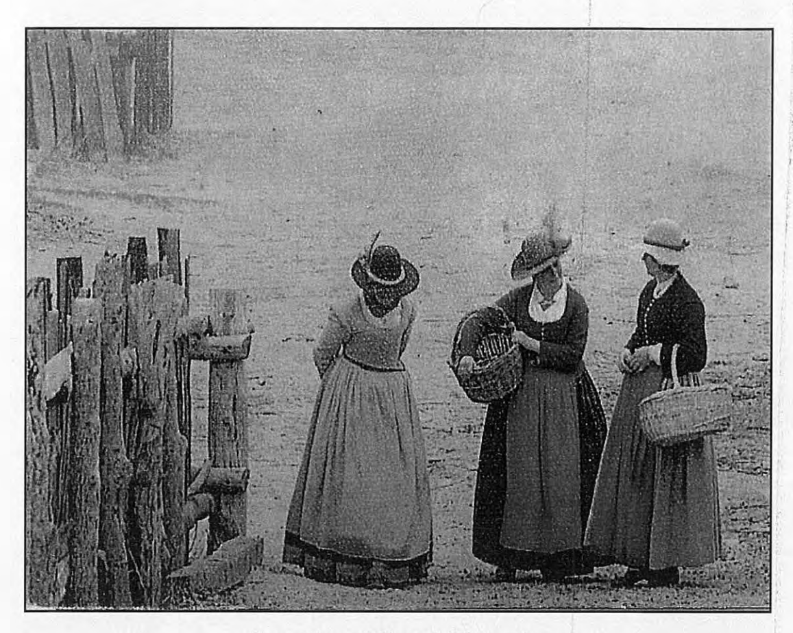
Scene from Plimoth Plantation

Soule Kindred in America, Inc. 53 New Shaker Road Albany, NY