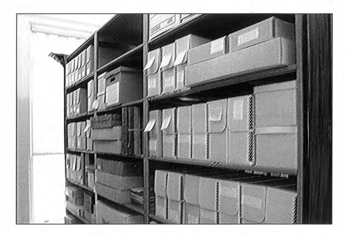
Stacks at the Drew Archives, Duxbury, MA