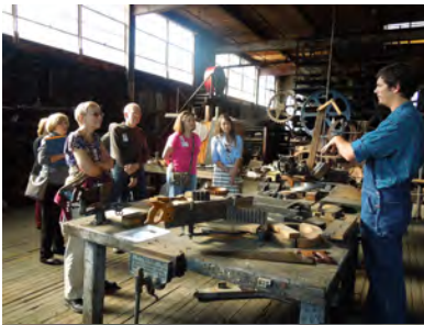
Soulé Steam Feed Works Meridian, MS

Southern Soule History at the Soule Kindred 2013 Reunion p. 6