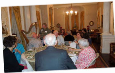
Banquet at Merrehope