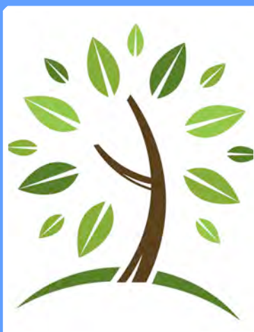
Soule Kindred Going "Green" Back Cover