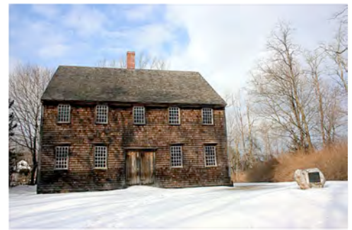
Oblong Meeting House, Dutchess Co., NY