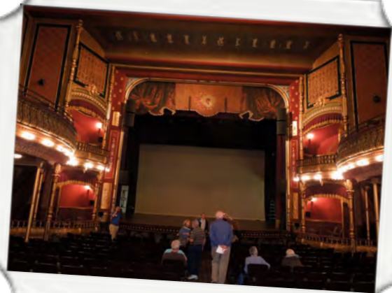
Grand Opera House