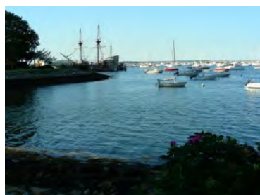
Plymouth Harbor and the Mayflower II