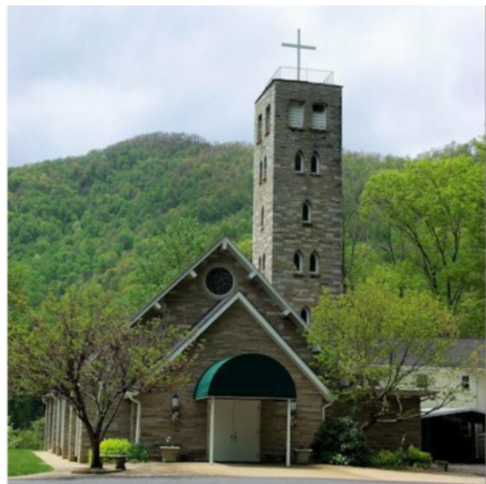
Saint Margaret of Scotland Catholic Church

The reunion will conclude with a brunch on Sunday morning and attendance at special reunion services at Saint Margaret of Scotland Catholic Church, up the hill from the retreat center.