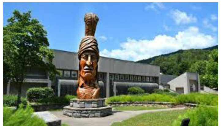
Museum of the Cherokee Indian