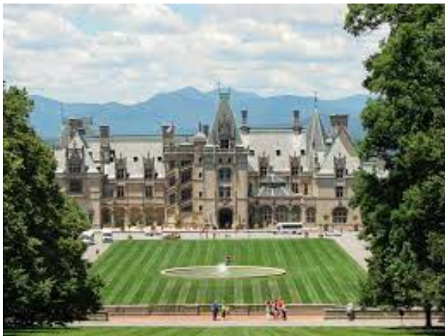
Biltmore House in Asheville, NC