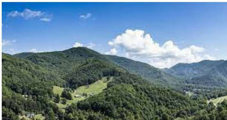
The Maggie Valley